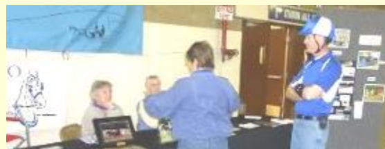
Colorado Driving Society members staff our carriage display at the Rocky Mountain Horse Expo and provide information about carriage driving.

Check out the Rocky Mountain Horse Expo website to learn about the many clinics and presenters offered.