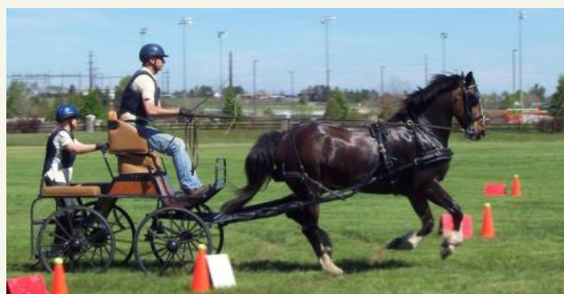
Photos of 2015 CDS Derby