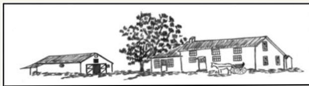
This illustration (artist unknown) was made from a photo of the 20-Mile House. See history at www.parkerhistory.org/#!20-mile-house/cuyi