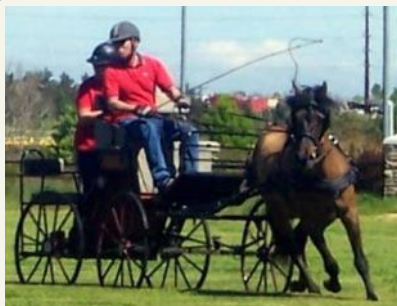
Al Senzamici driving Ragtime