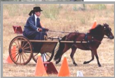
Pictured with 36" miniature horse; also used with a 40" small pony