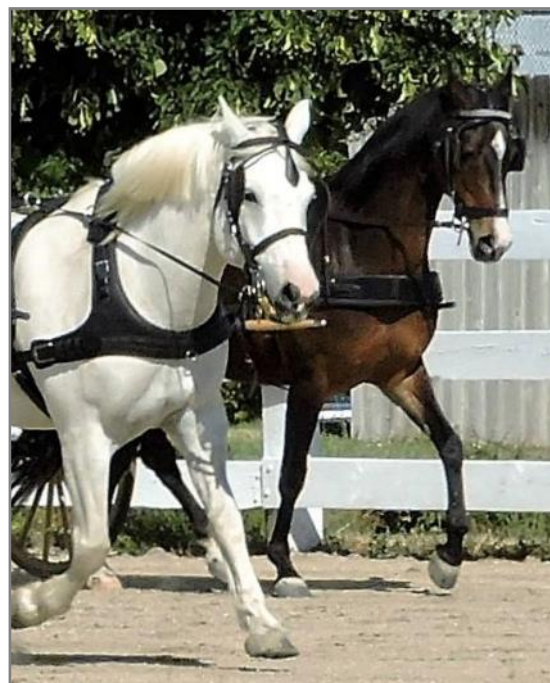
Study in contrast.

Meetings are currently held at the Franktown Firehouse, 1959 South State Highway 83, Franktown, CO 80116 (Southwest of the intersection of Hwy 83 (Parker Rd) and Hwy 86.)