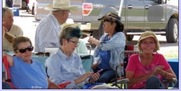
Competitors and Volunteers