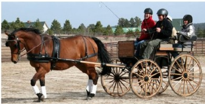
Eagle hitched to 16.2 warmblood

Contact: Jane McBride mcbride@q.com 719-598-4496 719- 231-2521