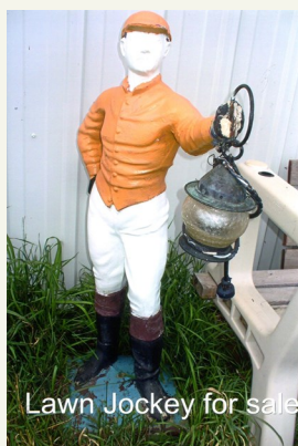
Lawn Jockey for sale