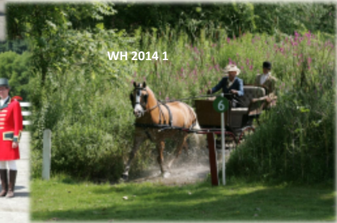
WH 2014 1