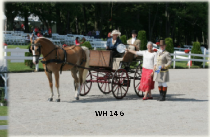
WH 14 6