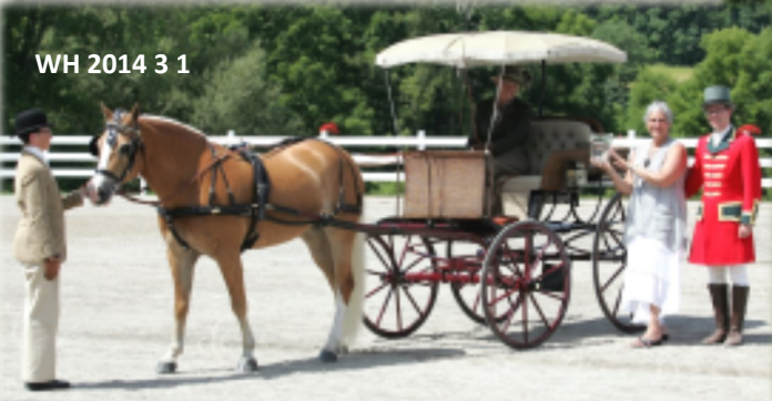
WH 2014 3 1