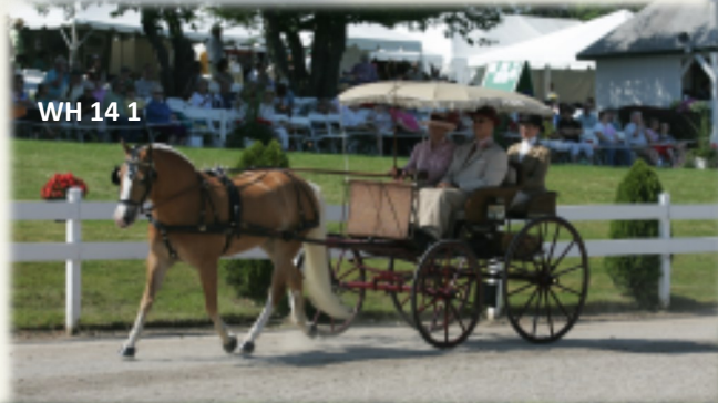
WH 14 1