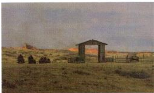
Burning Tree Fire 2011