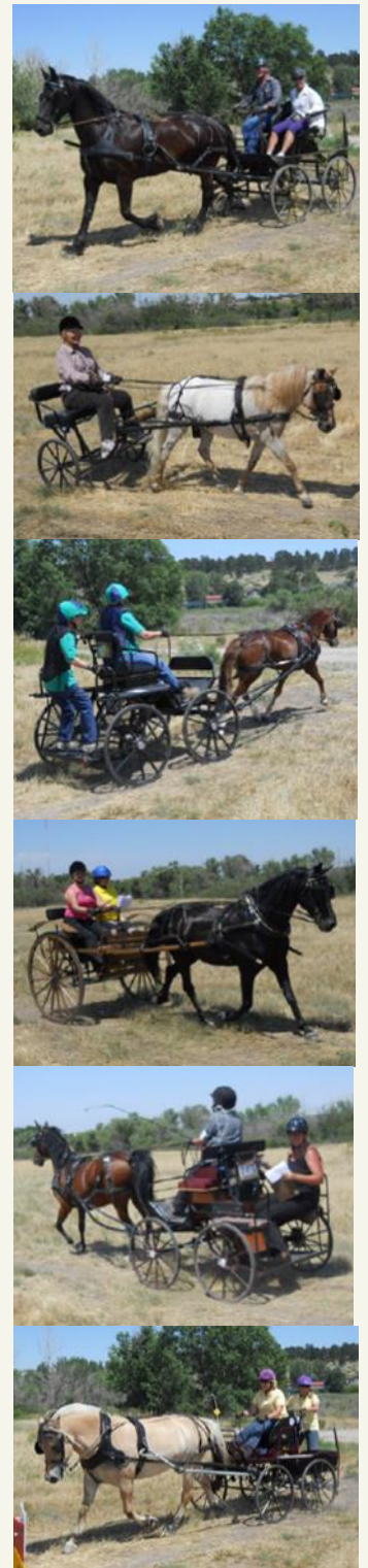
CDS 2013 20 Mile CDT

This illustration (artist unknown) was made from a photo of the 20-Mile House. See history at www.parkerhistory.org/#!20-mile-house/cuyi