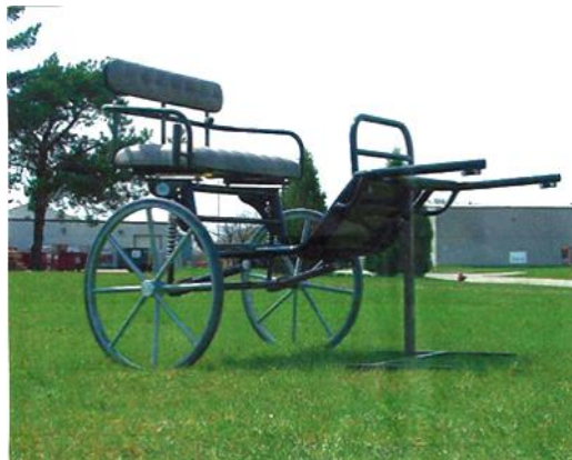
The Frey Sprint: the Hottest Selling Single Carriage in America today. Made in the U.S.A.

For the very finest Synthetic Harness & Accessories, Minis to Draft, Pleasure, Work & Competition. All Harness measured to fit. For over 1000 items to choose from, visit our web site: rockymountaincarriagesales.com