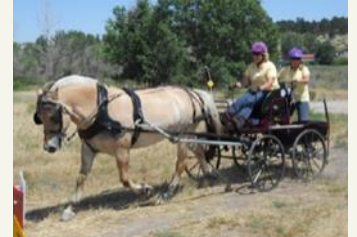
CDS 2013 20 Mile CDT